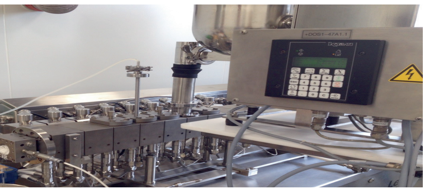
Fig 1: Manufacturing of granules using Leistritz ZSE 18 HPe-VA

An example of continuously produced typical Pharmatose<sup>®</sup> CM granules is visualized by SEM in Fig 2. Pharmatose<sup>®</sup> CM showed the most consistent granulation performance in terms of BD, TD, and PSD; where BD of granulations were within limits from 0.60 to 0.67 and TD varied from 0.82 to 0.92. The three tier PSD ranged as follows: X10 - from 47 to 60µm; X50 - from 188 to 289µm; and X90 - from 735 to 885µm. Fig 3 shows the cumulative volume distribution. The green line and the green dotted line represents the starting material and the granulated fine end of Pharmatose<sup>®</sup> 200M, respectively. The blue line and the blue dotted line represents the starting material and the granulated coarse end of Pharmatose<sup>®</sup> 200M , respectively. The orange line shows the starting material, whereas the dark orange line represents the granulated Pharmatose<sup>®</sup> CM.