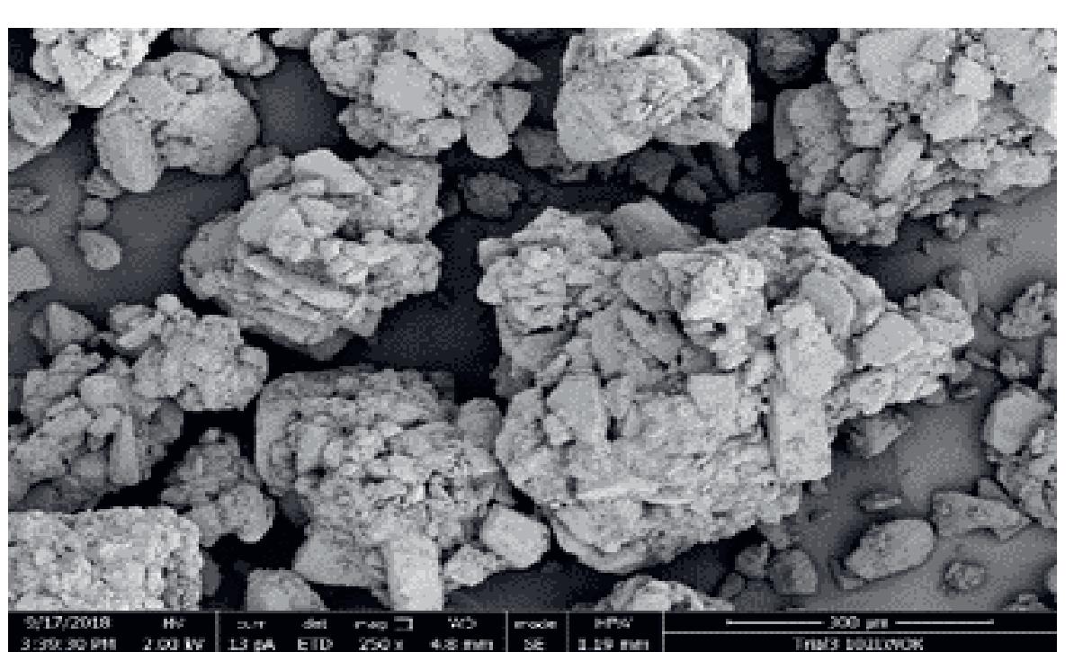
Fig 2: Typical SEM of Pharmatose <sup>®</sup> CM granules using TSE